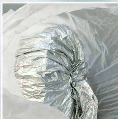
② Waterproof Package (Aluminum Foil+PE bag)