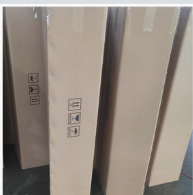
③ Carton Package