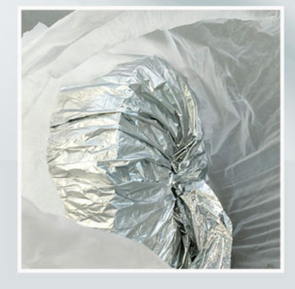
②Waterproof Package (Aluminum Foil+PE bag)