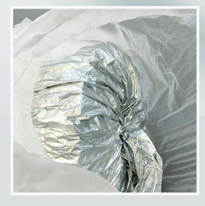
②Waterproof Package (Aluminum Foil+PE bag)