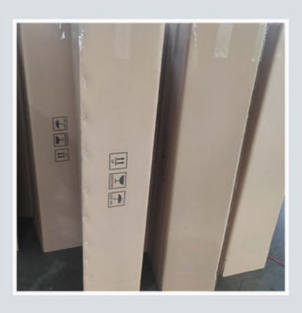
3 Carton Package