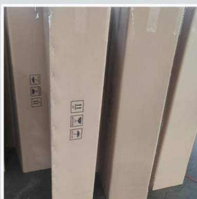
③ Carton Package