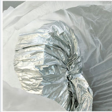
② Waterproof Package (Aluminum Foil+PE bag)