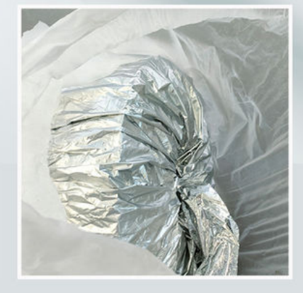
②Waterproof Package (Aluminum Foil+PE bag)