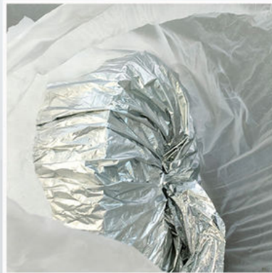
②Waterproof Package (Aluminum Foil+PE bag)